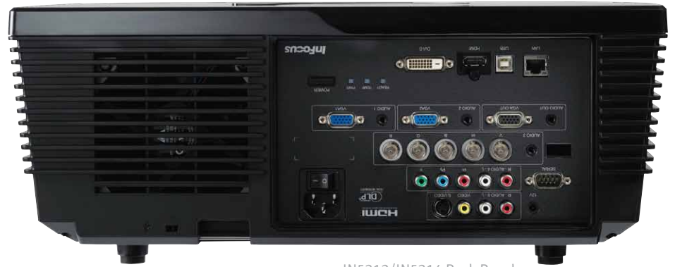
IN5312/IN5314 Back Panel

The 4000 lumens of the IN5314, IN5316HD and IN5318 display crisp, detailed images even in bright rooms. But if even more brightness is needed, you can bump it up to 4500 lumens with the IN5312. Plus, their single-lamp design makes it economical and easy to maintain.